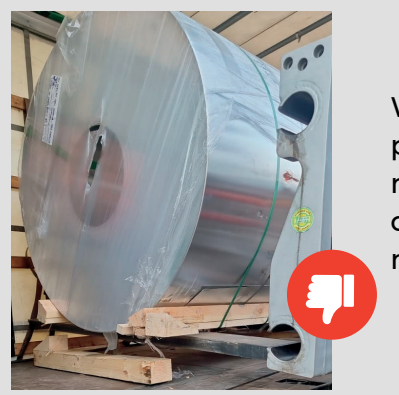
Wood must be placed under material to avoid direct lifting of material.

Insufficient assembly of the pallet and inclined beames the coil is resting in.