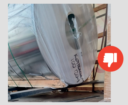
The coil mold is not protected with cardboard or foil, resulting at surface damage at unloading.